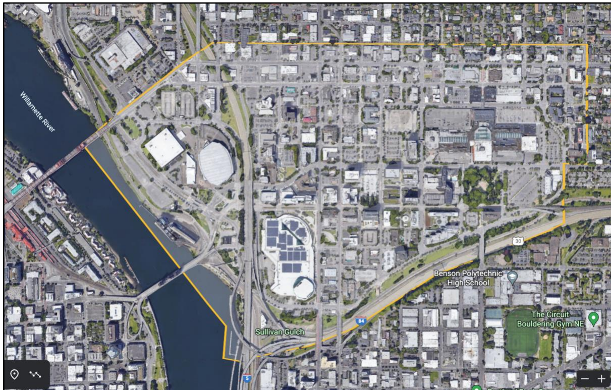
Image depicts an aerial view of Lloyd with the Lloyd EcoDistrict boundary outlined in yellow as described above.

The boundary is depicted below and can be viewed in Google Earth here .